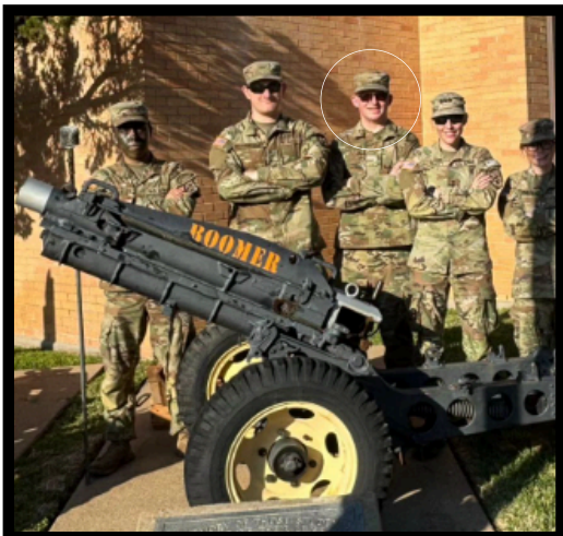
HERE COMES THE BOOM!! The Cannon Crew